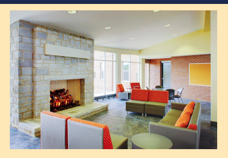
North Georgia Suites common space