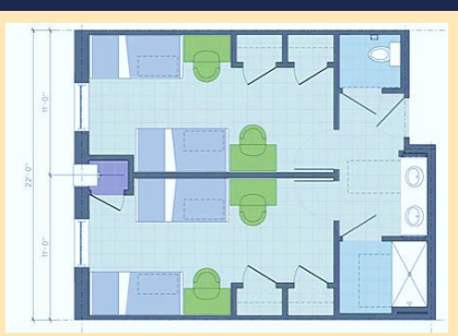
Suites Layout (double occupany)