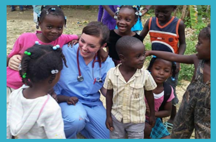
Former Boar's Head Brigade cadets making a difference in Afghanistan (left) and Haiti (above)