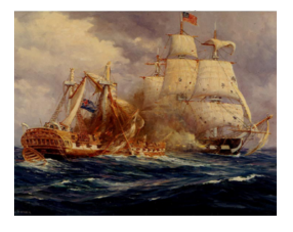
Figure 11.4 The Constitution and the Guerriere | Depiction of the Constitution and the Guerriere. The damage to the Guerriere was considerable.

down the sides of the ships. If the gunners were good, they could target the masts of the other ships; without masts, the enemy ship would be unable to maneuver or flee. To bring these guns into play, the two ships would sail past each other as close as each captain dared. After each pass, they turned to bring the guns back into position and fire again. Ultimately, the Constitution blasted the mizzen mast from the Guerriere ; it fell overboard but was still attached to the ship, acting as a drag and preventing the British