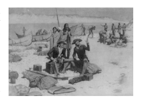
Figure 11.1 Lewis and Clark | This image shows Lewis and Clark while on their journey to find the Northwest Passage.

The bad blood and immense distrust between the Federalists and the Republicans created some judicial controversies. Federalists dominated Congress; to stop Jefferson from being able to appoint a Republican to the