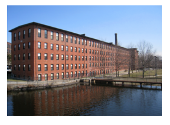
Figure 11.5 Lowell's Mill | This photograph of Francis Cabot Lowell's mill at Waltham, Massachusetts.

Cotton became a cash crop for the South thanks to Eli Whitney's cotton gin, invented in 1793. Cotton has two forms: the long staple, which has long fibers and relatively easy-to-remove seeds, and short staple, which has shorter fibers and a difficult-to-remove seed. The long staple cotton was most desirable but could only be grown along the coast. Inland cotton planters had to grow the less-valuable short staple cotton. The only way to make any profit from growing the short staple cotton was to produce large quantities of it. Whitney's gin made this possible because it removed the seeds quickly, making production faster. Thanks to Whitney's gin, the short staple cotton supply soon dominated the market. As Americans moved into the Old Southwest, they also found the soil well-suited to grow short-staple cotton. With the price of cotton rising on the international market, new land was quickly put into production in an effort to make a profit. From 1800 to 1820, cotton production increased significantly, from somewhere around 73,000 bales to 730,000 bales, and the numbers continued to rise throughout the century. By mid-century, the United States produced roughly 68 percent of