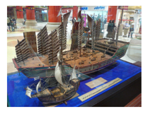
Figure 2.2 Zheng He's Ships | A comparison shows how Zheng He's treasure ships dwarfed Columbus's ships.

One shipyard near Nanking alone built 2,000 vessels, including almost a hundred large treasure ships. The latter were approximately 400 feet long and almost 200 feet wide. Dragon eyes were carved on the prows to scare away evil spirits.<sup>7</sup> Anatole reminds us that "The large Chinese ships, majestic and impressive, and more than enough to fill with awe a country of lesser stature than the mighty Ming, were first and foremost built for military personnel transport."<sup>8</sup>