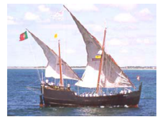
Figure 2.1 Caravel Boa Esperança of Portugal | The triangular sailed, square rigged caravel was quick, agile, and seaworthy.

Like the Spanish and other Europeans, the chief desire of the Portuguese was to tap into the lucrative