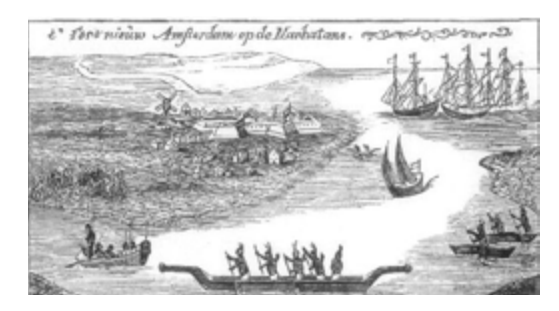
Figure 5.1 Fort Amsterdam | In the 1620s, the Dutch began to settle the New World. This depiction of their settlement on Manhattan Island appeared in Charles Hemstreet's The Story of Manhattan published in 1901, with the caption "Earliest Picture of Manhattan."

The upper portion of New Netherland continued to focus on the fur trade. To preserve that trade, the DWIC worked to sustain a healthy relationship with the five tribes of the Iroquois Nations, especially the Mohawk. The friendship proved beneficial for both sides. The