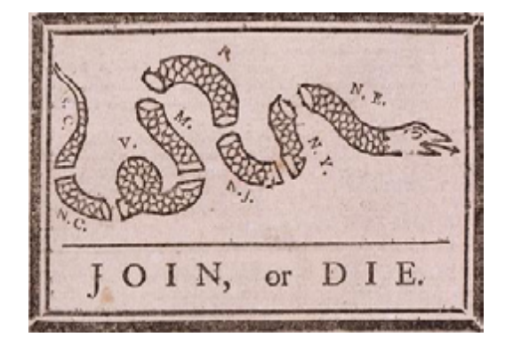
Figure 7.2 Join or Die | Franklin's cartoon encouraging membership in the Albany Congress has since been viewed by many as predictive of the formation of the United States, as many parts make up the whole

the first time in the series of colonial wars when the colonies considered some kind of formal union. Great Britain's Board of Trade had called for the meeting in order to discuss Indian relations and to meet with the Iroquois, hoping for an alliance. They were disappointed; the Iroquois refused to commit themselves to the British. Much of the meeting instead was spent debating Benjamin Franklin's Plan of Union, which sought to create a formal colonial union. The plan