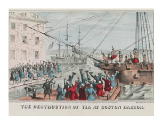
Figure 7.5 Boston Tea Party | On December 16, 1773, a group of "Indians" stormed a British tea ship anchored in the Boston harbor and dumped 342 chests of tea overboard. The reaction of the British would eventually lead the colonies to revolution and

was, wrote in his diary: "3 Cargoes of Bohea Tea were emptied into the independence. Sea. This is the most magnificent Author: Lithograph by Sarony & Major moment of all. There is a Dignity, a Majesty, a Sublimity, in this last Effort of the patriots that I greatly admire."25