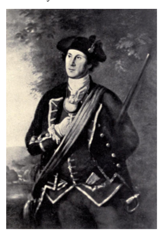
Figure 7.1 George Washington | Washington wearing his French and Indian War colonel's uniform of the Virginia Regiment. This is the earliest authenticated portrait of Washington and appears in Woodrow Wilson's book George Washington .

The French and Indian War arose from border tensions when Virginians crossed the Allegheny Mountains into the Ohio River Valley, an area claimed by both the British and the French. The French responded to this