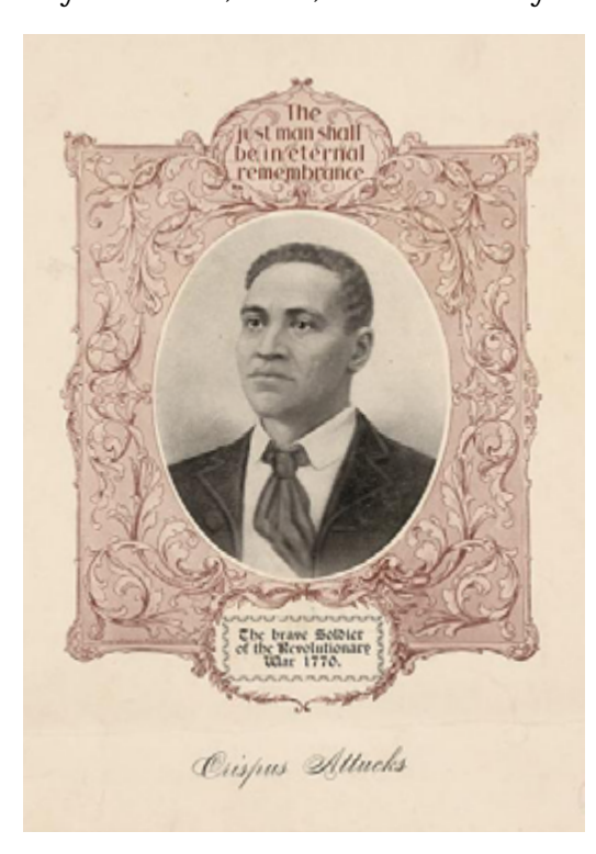
Figure 7.4 Crispus Attucks | Crispus Attucks was among the first colonials killed in the skirmish between the Bostonians and British soldiers in what was called the "Boston Massacre."

Franklin was correct in his fear that blood might be shed. On one wintry day in March, 1770, a crowd of boys threw rocks and snowballs at the British