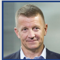
MR. ERIK PRINCE CEO and Executive Director, Frontier Services Group