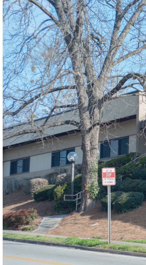
H.M. Stewart Sr. Professional and Continuing Education Building in Dahlonega.