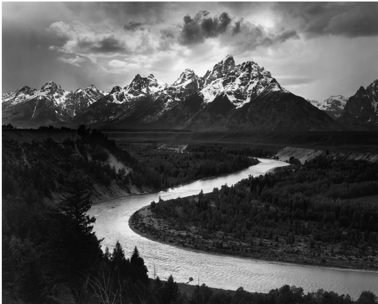
Ansel Adams Classic Image: Tetons and Snake River.

Ansel Adams is famous for his black and white images. He was a landscape photographer and environmentalist from 1902 to 1894. His life-long advocacy for environmental conservation helped him expand the National Park system. He was awarded the Presidential Medal of Freedom in 1980.