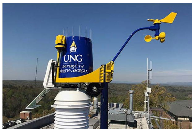
The UNG Weather STEM Station

UNG has data collecting weather stations at each of the five campuses. The study of weather provides an excellent foundation for science, technology, engineering and math (STEM) education. The system provides an array of public safety features including lightning alerts, severe weather alerts, temperature forecasts, environmental cameras and agricultural monitoring. It also archives past weather and gives weather forecasts for the coming days. The data can be used to teach about atmospheric pressure, windspeed and direction, and cloud types. The system creates cloud movies, 24-hour time-lapse videos that show the sky conditions for an entire day, in less than a minute. The videos are linked with graphs of temperature, pressure, and dew point.