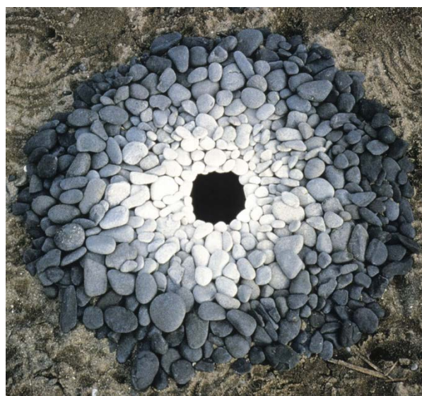
Andy Goldsworthy: Artist that collaborates with Nature.