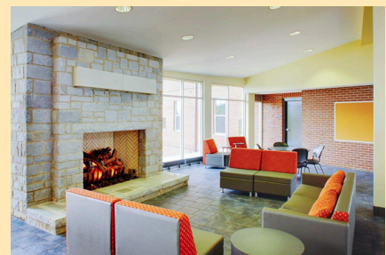
North Georgia Suites common space