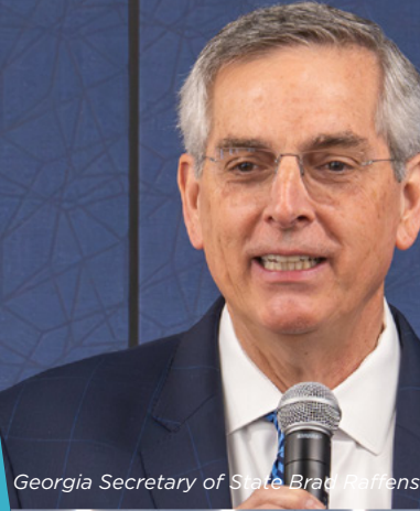
ensberger presented opening remarks