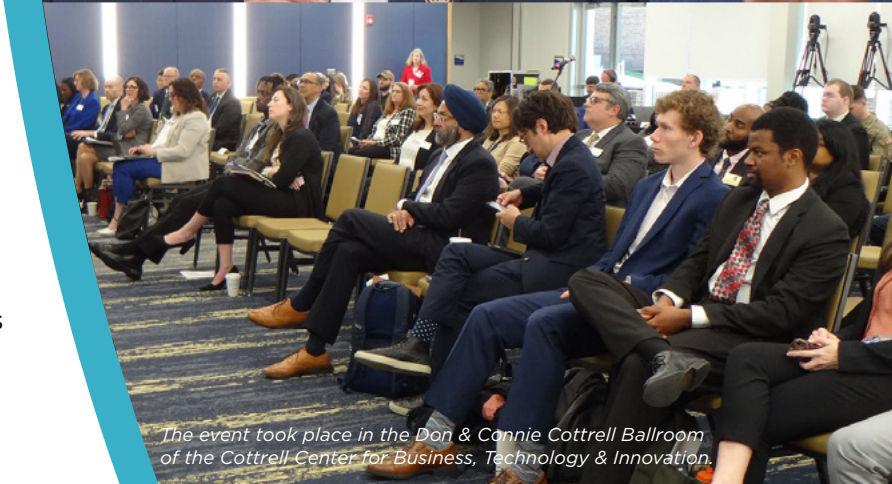
The event took place in the Don & Connie Cottrell Ballroom of the Cottrell Center for Business, Technology & Innovation.