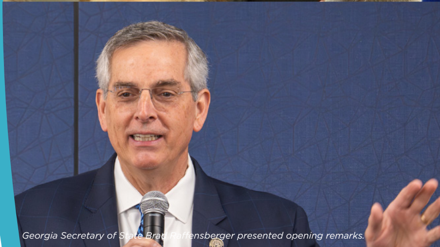
Georgia Secretary of State Brad Raffensberger presented opening remarks.