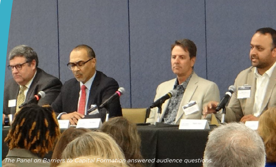
The Panel on Barriers to Capital Formation answered audience questions.