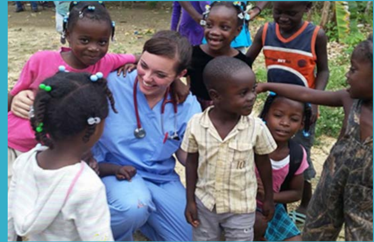
Former Boar's Head Brigade cadets making a difference in Afghanistan (left) and Haiti (above)