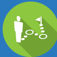
PERSONAL DEVELOPMENT T