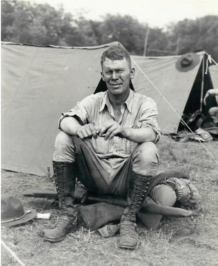
Figure 1: Lieutenant Colonel Henry E. Gardiner bivouacking during pre-deployment training during the Louisiana Maneuvers

employed in the legal department of the Anaconda Copper Mining Company in Butte, Montana.