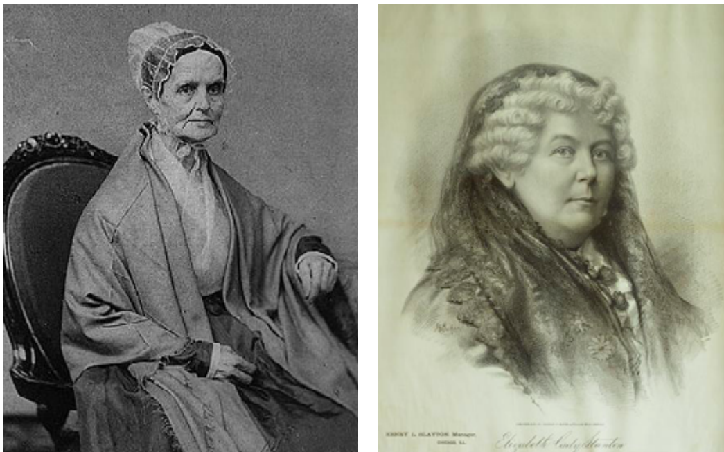
Figure 13.2 Lucretia Mott and Elizabeth Cady Stanton | These two women were instrumental in organizing the Seneca Falls Convention and writing the Declaration of Sentiments, which would articulate the goals of the women's rights movement.

Author: Unknown (Mott), Carol M. Highsmith (Stanton) Source: Library of Congress