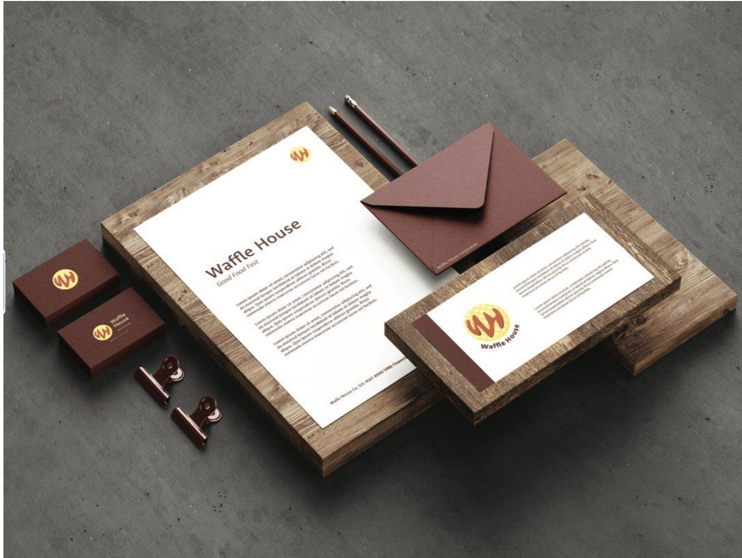
Waffle House Rebranding Adobe Creative cloud, various sizes ART 4458 Design Practices & Production Fall 2024